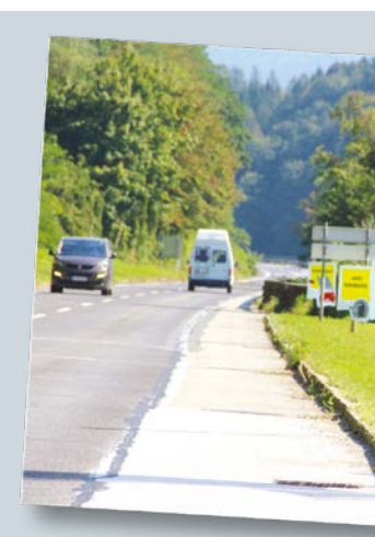
The signs contribute to environmental protection.

The new signs needed to be weather-proof – after all they are intended for long-time service. Drawing on years of experience and its profusion of manufacturing options, Forster can deliver the optimal solution tailored exactly to requirements. Whether it is sunny, rainy or snowy, the aluminium dibond composite panels are weather- and UV-re-