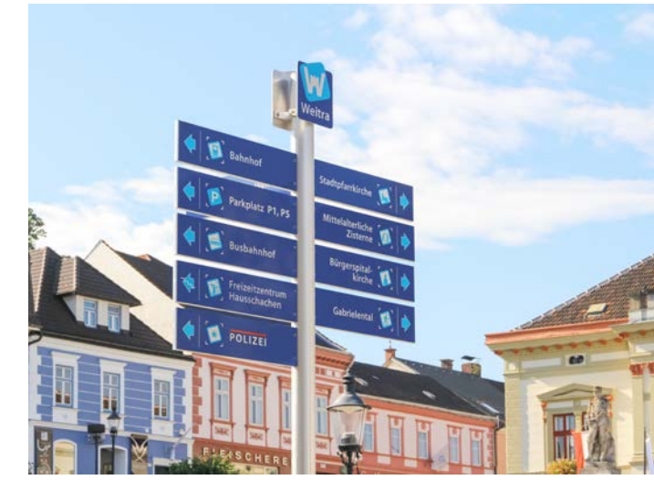
A nice detail: the town logo sits on the structure as a separate sign.

are infopoints for tourists and themed walks. At three prominent locations – the Weitra tourist service point, the historical town gate and the parking lot at the Hausschachen pond – infopoints explain the main tourist attractions. Moreover, four themed walks invite roamers to stroll through the picturesque old part of the town. One of them is the "Beer Mile" that opens up unusual perspectives of beer at nine stations, each of which provides a neat, compact but still detailed narrative on the subject of beer. They all have a consistent appearance, which, thanks to Combiflex CF 40, can be updated for many years to come. Together, they combine to help non-local visitors find their way.