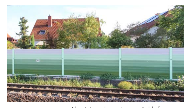
Aluminium elements are suitable for harmonious colour gradients.

product programme – there is virtually no limit to customising the barrier's optical appearance. Aesthetically sensitive areas – historical landscapes, nature reserves and touristically valuable zones - all profit considerably from the individual design options offered by Forster noise barriers. Forster noise protection systems offer not just a high degree of flexibility and wide range of applications, but they also facilitate solutions that accommodate schemes tailored to the specific situation.