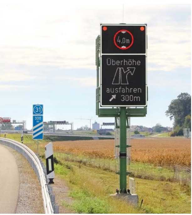
LED displays promptly send a diversion signal to excessively tall vehicles.

Tutting Motorway Tunnel Owner: Die Autobahn GmbH