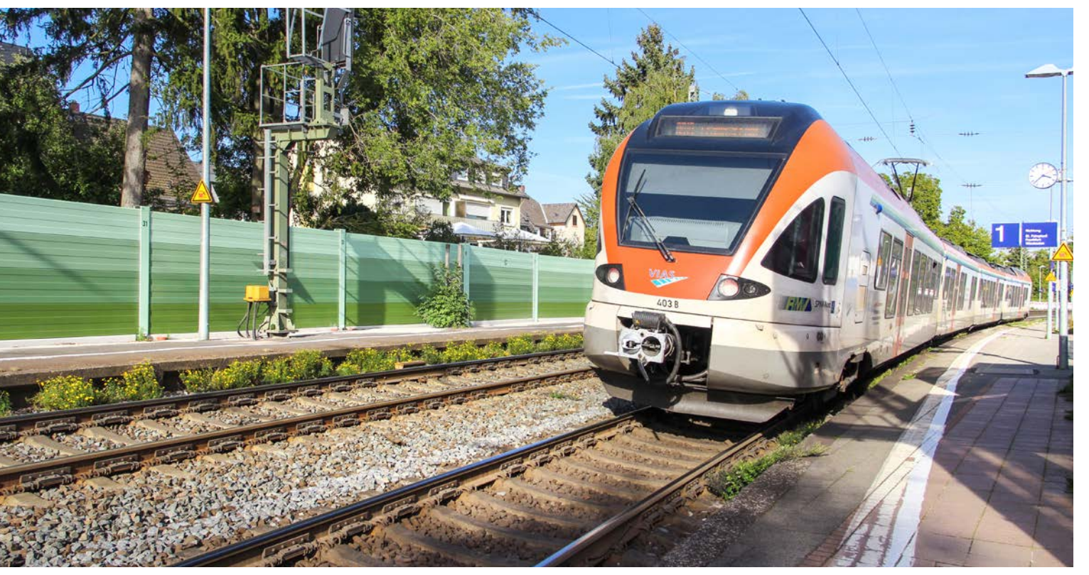
The new noise barriers will bring further relief from the noise pervading the UNESCO world heritage site.