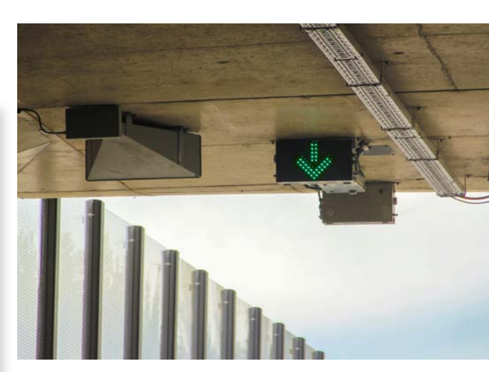
Twenty-four continuous light signs indicate the open and closed lanes in the tunnel.