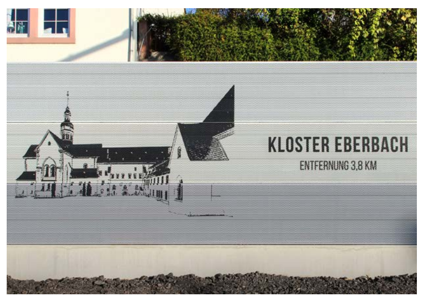
Using digital printing, we apply images, artwork and symbols directly onto the panels.