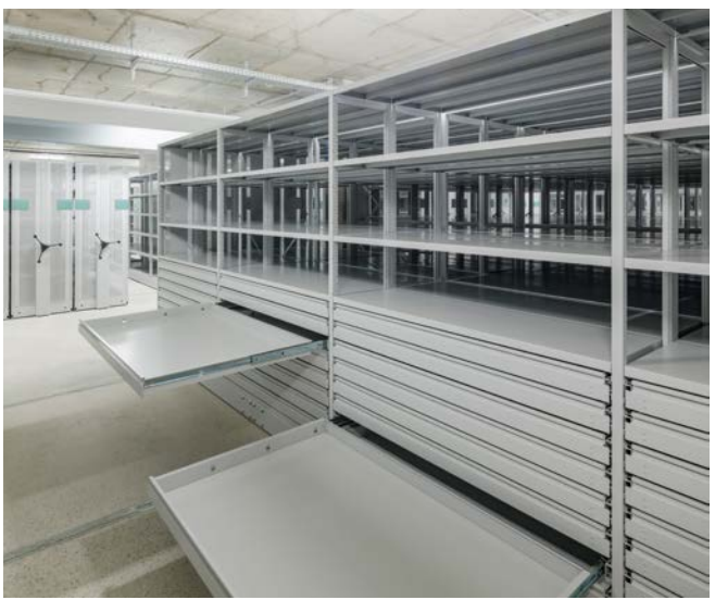
Artwork is kept in large- and super-sized drawers.

to 80 kg. Fitting the drawers into the shelving system has made it extremely flexible and ready for expansion. This concept has been proved so useful when the first items were relocated to the depot that further drawers are already being planned.