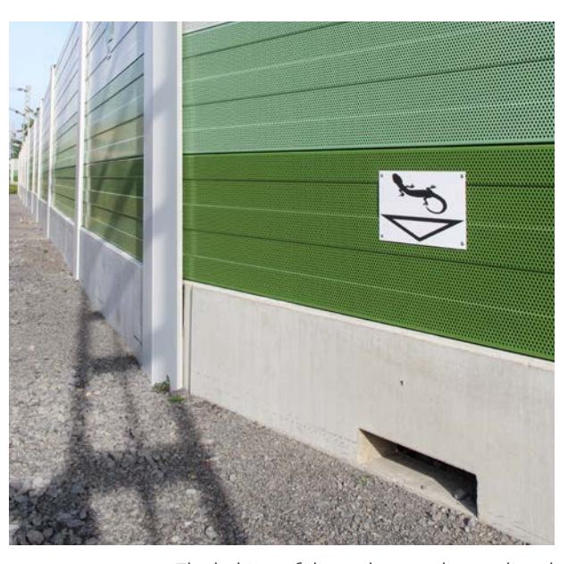
The habitat of the endangered green lizard has been preserved.