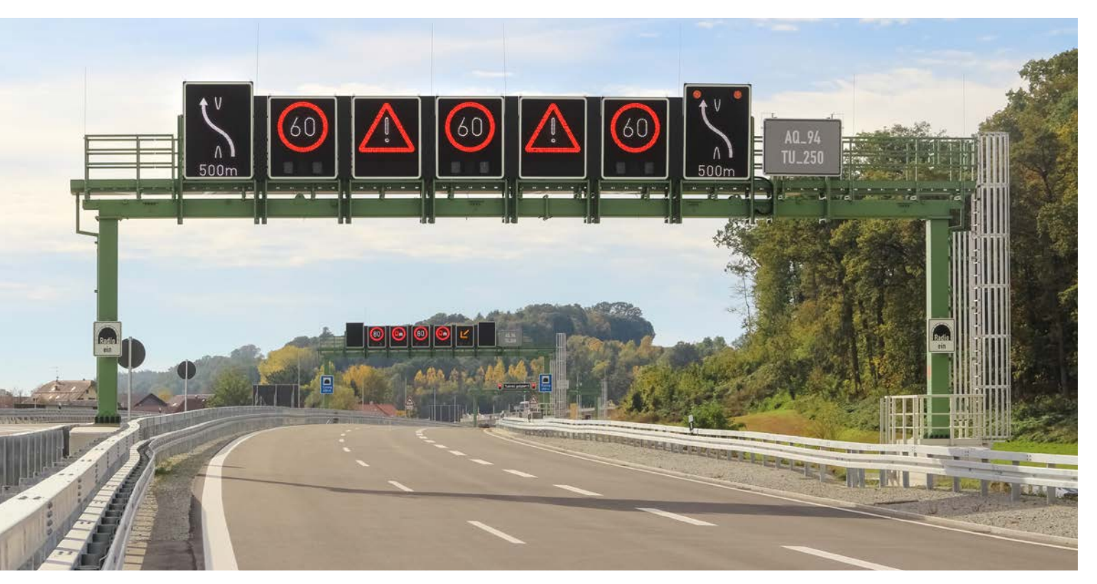
Altogether 15 gantries make sure that the traffic flows smoothly.