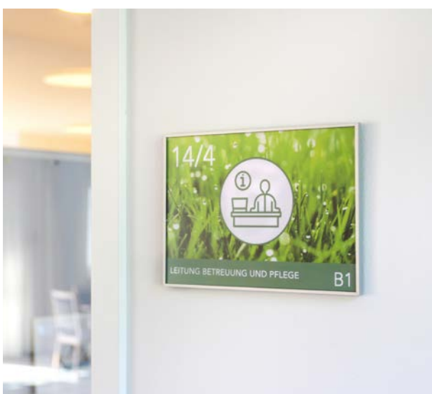
The Combiflex Mero system is distinguished by its modern and aesthetically pleasing design.