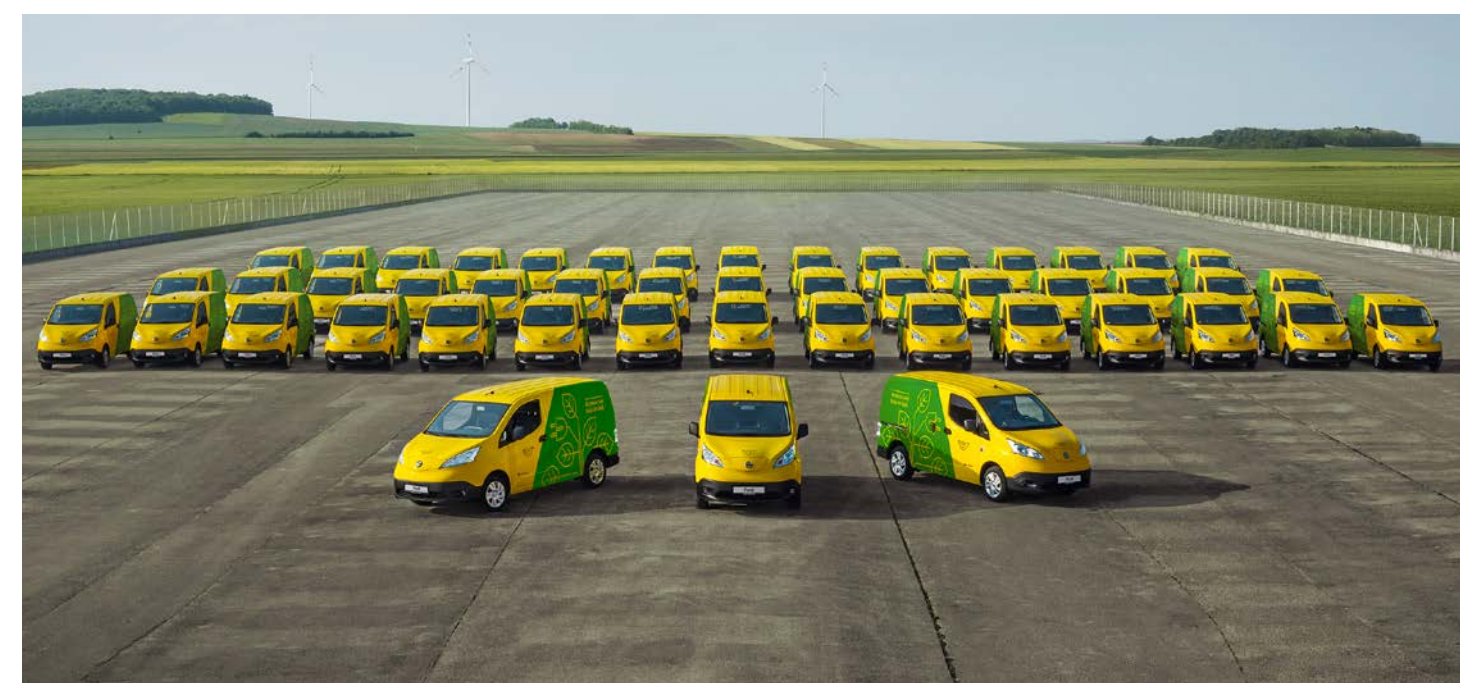
Wrapping for over 700 new electric vehicles for the Austrian Postal Service.

FLEET SIGNAGE FOR THE AUSTRIAN POSTAL SERVICE