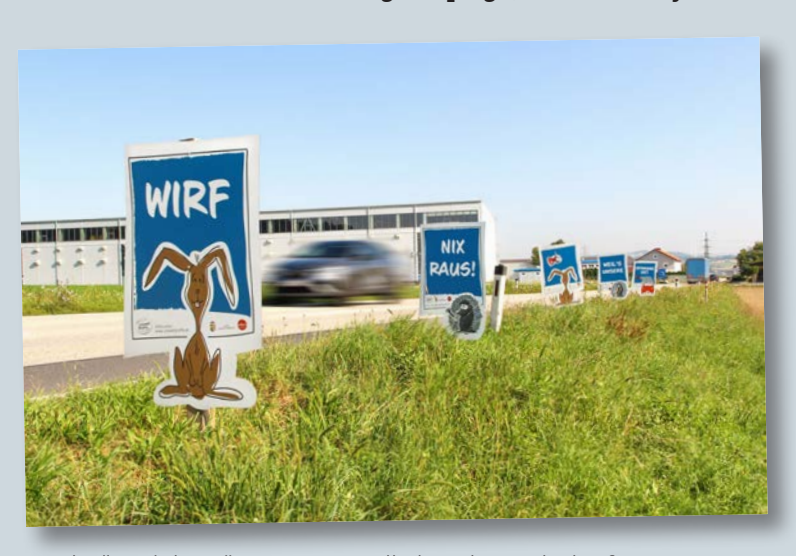
The "Don't litter" signs are installed on the roadsides for maximum visibility.

aims to prevent motorists from littering the roadside. The message is delivered by signs made by Forster.