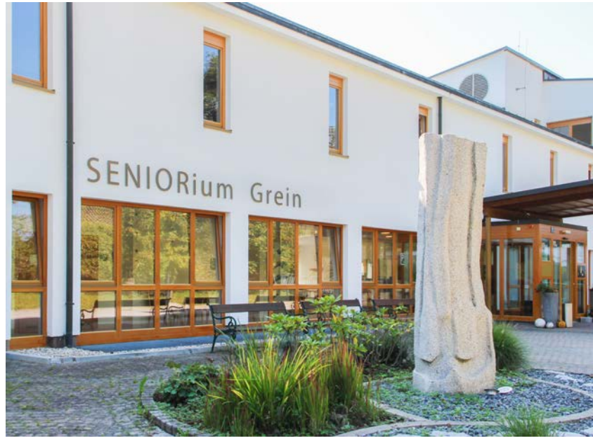
The building signs are made of laser-cut lettering.

fully refurbished and at the same time made more visible: visitors approaching the SENIORium in the picturesque Mühlviertel cannot overlook its prominent sign. The laser-cut metal letters were coated in RAL 7006 beige grey to match the colouring of the building.