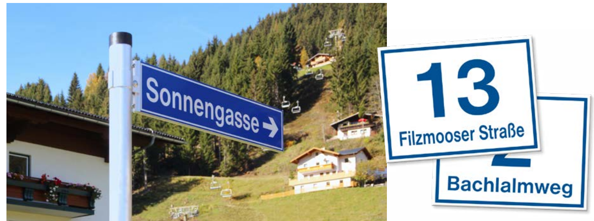
Street signs (hollow section design) point the way within Filzmoos.

Such advantages convinced the community of Filzmoos. It chose CF 40 tubular frames holding street signs in hollow section design. The system is variable in width and height, and the signs themselves are available in many different formats. The signs can be exchanged quickly, and are easily bought from Forster's online shop whenever needed. The same applies to the house number plates which were replaced as part of the new routing system. These serve mainly a practical purpose but can still be personalised thanks to our wide range of design options.