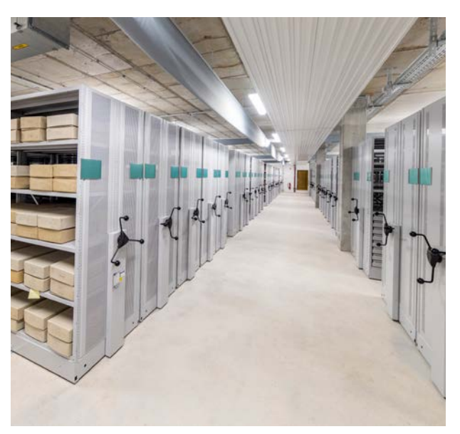
Mobile shelving doubles storage capacity.

A safe place for history: after just 20 months of building, Darmstadt