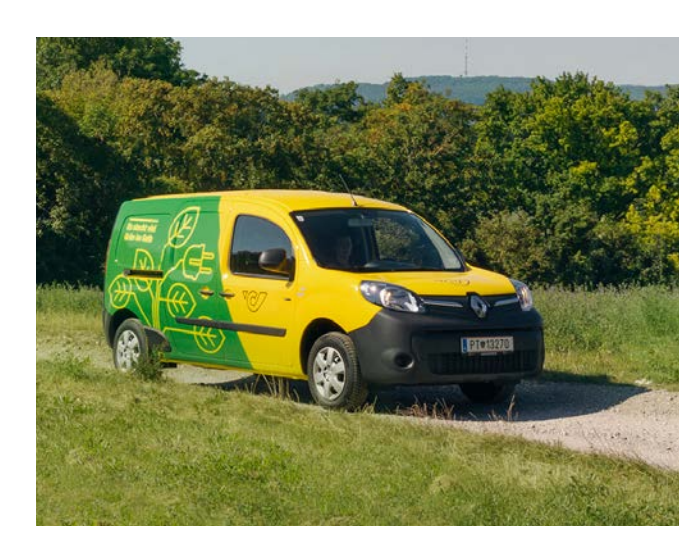
The green colour of our film impresses as sustainable and harmonises with the surrounding.

is also especially long-lived and robust. If it needs to be removed or changed, it can be pulled off in one go without tearing.